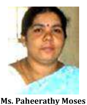
Senior Lecturer Gr. I in Sociology & Anthropology Department of Social Sciences Faculty of Arts and Culture Look after the duties of Head/ Dept. of Social Sciences, Faculty of Arts and Culture,